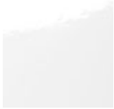
L7 белый глянцевый лак