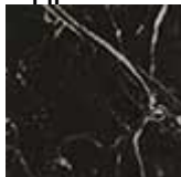
NM черный полированный Marquina