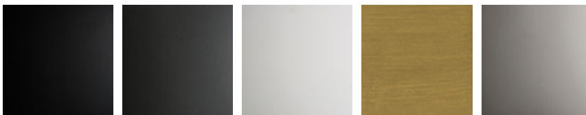
OP17 черный матовый