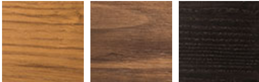
HR Состаренный дуб