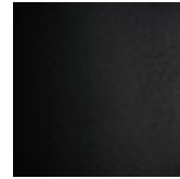
GFM73 матовый с тиснением черного цвета