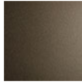
GFM11 матовый с тиснением титан цвета