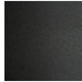
GFM69 матовый с тиснением цвета графит