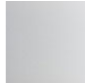
GFM71 матовый с тиснением белого цвета