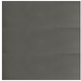
OPO Окрашенное прозрачное