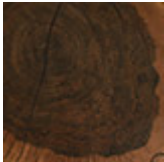
MDF шпонированный срезом ствола дерева