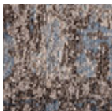
хлопковой синели Radja