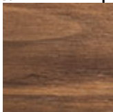
NC американский орех