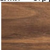
NC американский орех