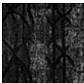
хлопковой синели Mumbai