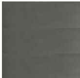
OPO Окрашенное прозрачное