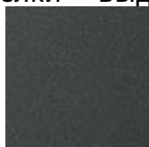
GF69 матовый лак с тиснением графит