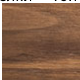
NC американский орех