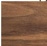
NC американский орех