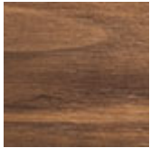
NC американский орех