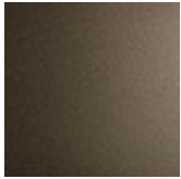
GFM11 матовый с тиснением титан цвета