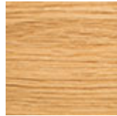
RN естественный дуб