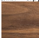
NC американский орех