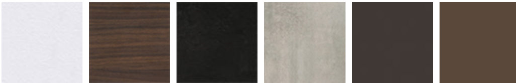
LM02 Белый climb