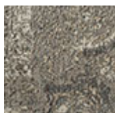
хлопковой синели Chennai