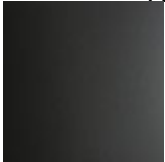
OP69 графит матовый