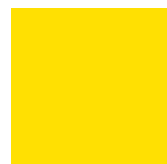
OP86 желтый матовый